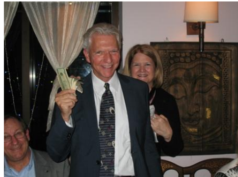
Cedar wins $95 with 50/50