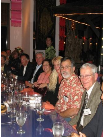
Long tables with good friends