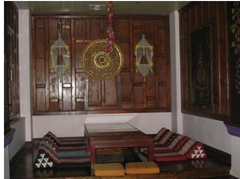
One of their intimate dining areas