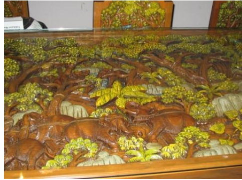
The artwork under the glass table top