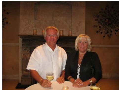
In Tampa Bay