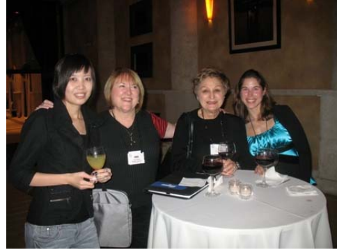
With family and friends