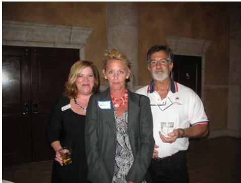
To make it all perfect