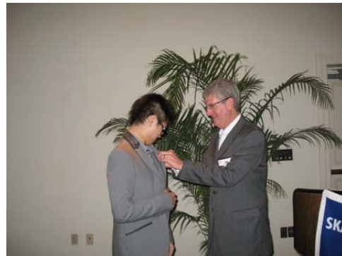
And pinned a Young Skålleague