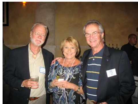
Called A La Carte Pavilion