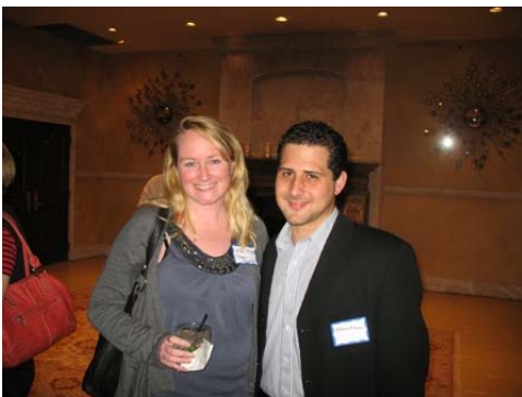
They will host your events