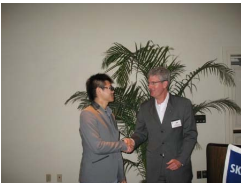
Then 50/50 was drawn