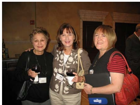
Without costing a million