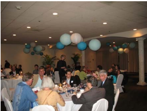
We enjoyed ourselves