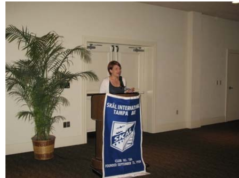
They'll do backbends