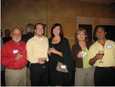
Great place to connect