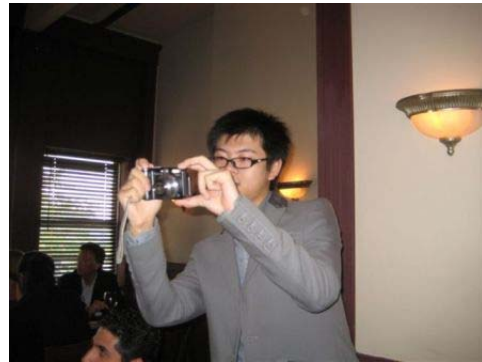
Jeff – our photographer