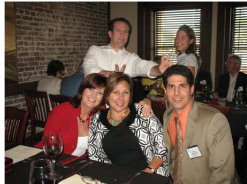
The fun began and got out of control...