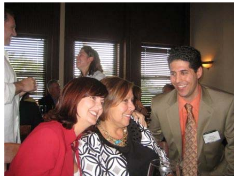
Let the fun begin