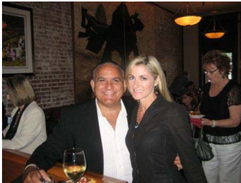
Let the honeymoon begin