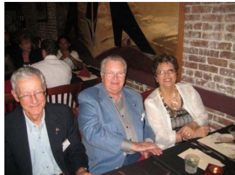
Popie will feel at home next month at Acropolis