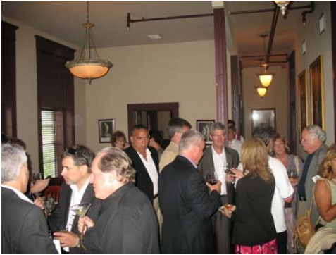
We had a nice crowd on the Hillsborough side