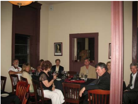
The table that had the most fun!