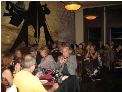
The top floor of Benini's